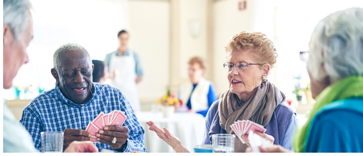
Everyone needs a reason to get out of bed. For some this may be friendship, food and fun in the day center.

Call 463-271-3700 and ask to speak to someone in the Intake Department. They will explain the enrollment process. Enrollment is voluntary. You may disenroll at any time by notifying your Ascension Living St. Vincent PACE social worker.